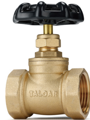
G103 1/2" - 2"